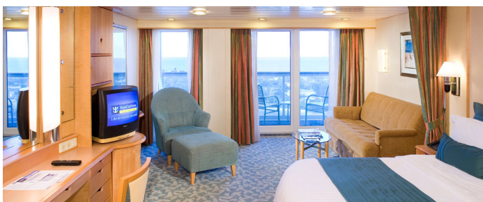
JUNIOR SUITE (Includes Balcony)

Prices are Per-person and based on double occupancy. Your lodging cost is "all-inclusive" and includes your stateroom, meals, pre-paid gratuities, taxes, security fees, and licenses.