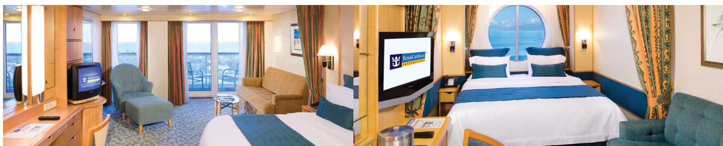
JUNIOR SUITE (Includes Balcony)

Prices are Per-person and based on double occupancy. Your lodging cost is "all-inclusive" and includes your stateroom, meals, pre-paid gratuities, taxes, security fees, and licenses.